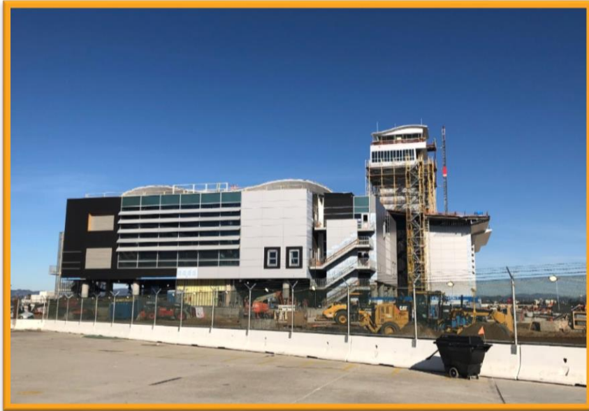
MSC Construction Date of photo: Early January 2020