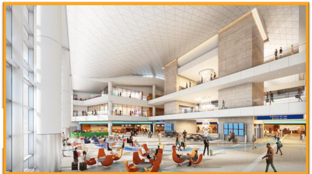
Rendering: Midfield Satellite Concourse, Interior