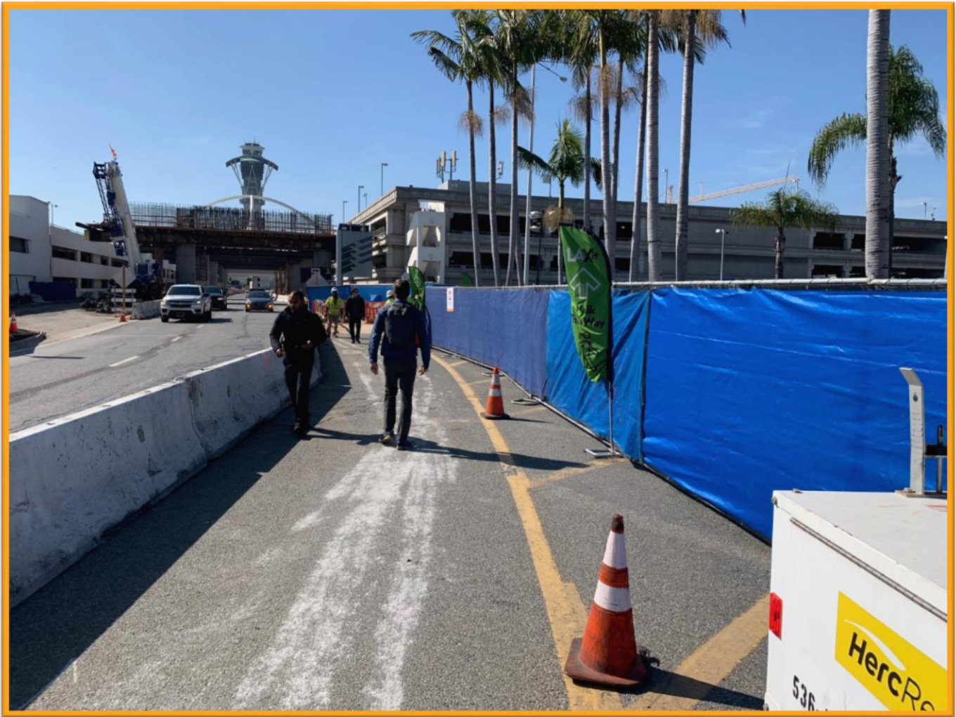
Temporary path along Center Way for Automated People Mover construction