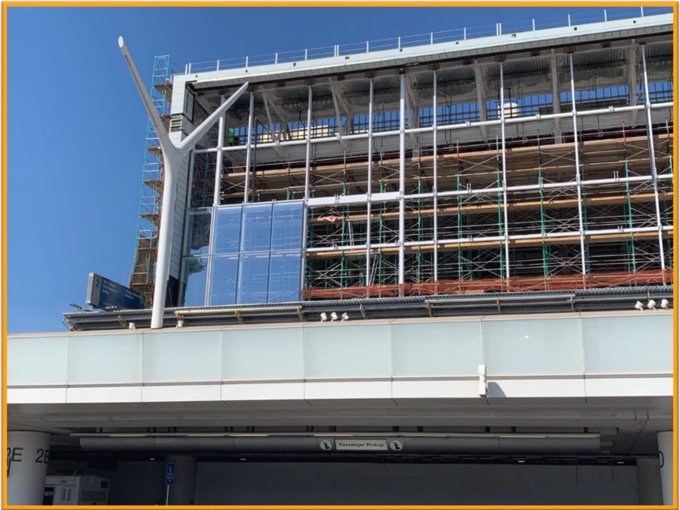
Terminal 1.5 Exterior Panel Installation